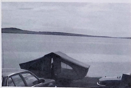
The scene from our campsites