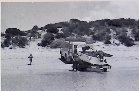
Rosemary of Pt Lincoln dive centre launching Maxi boat