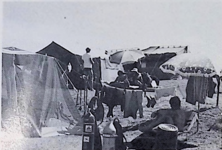
Relaxing at the camp.