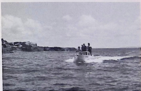
Arrival at Smith Island.