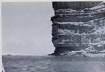
Inside Cape Wiles Lagoon