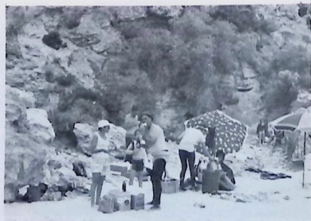
hunch at Fishery Bay.