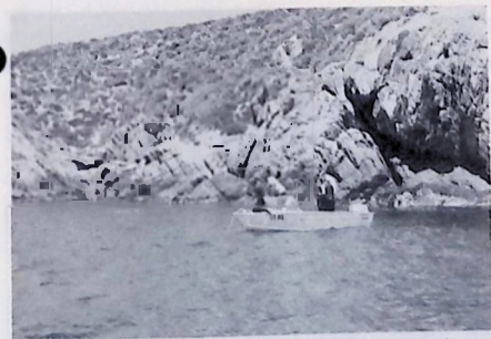
Commencing dive at Smith Island.