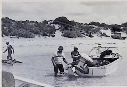
About to depart for Smith Isl.