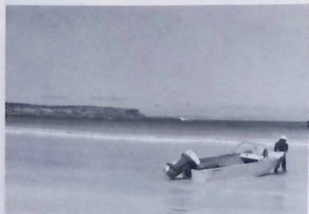
Bob minding the boat.