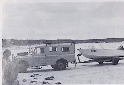
launching at Fishery Bay