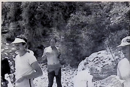
Lunch at Fishery Bay.