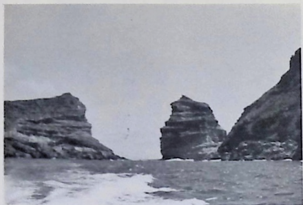
Approaching Cape Wiles.