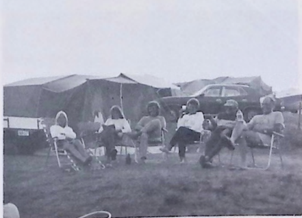
Relaxing in the evening