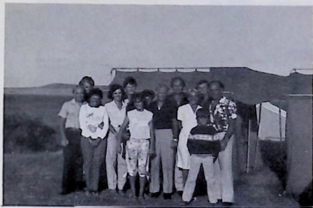
VSAG at the camp.