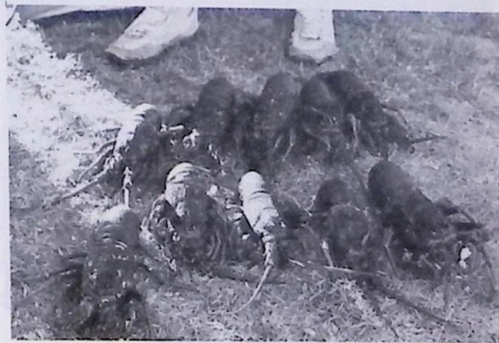
The Grey Ghost's Catch.